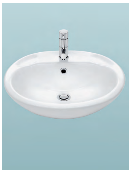
Chrome waste shown above supplied as standard late 2010

The Symphony semi recessed basin offers a traditional design whilst complementing your benchtop and tapware selection. This basin is suitable for domestic, commercial and disabled applications (refer to Compliant Product section).