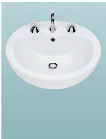
Chrome waste shown above supplied as standard late 2010

The Venecia Basins feature clean lines and smooth finishes for a sleek look and fuss-free maintenance. The basin is a cost-effective way to bring contemporary style to your bathroom. This basin is suitable for domestic, commercial and disabled applications (refer to Compliant Product section).