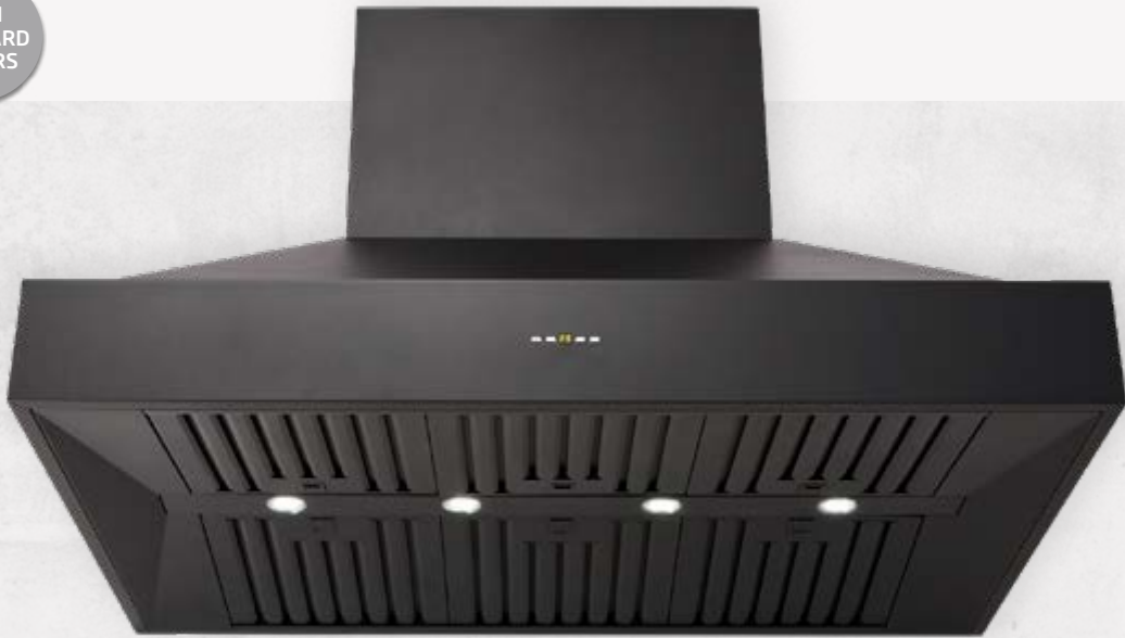
// CL8912B (120 cm)