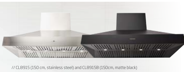
// CL8915 (150 cm, stainless steel) and CL8915B (150cm, matte black)