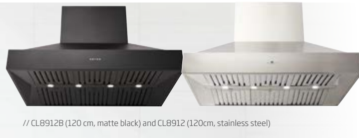
// CL8912B (120 cm, matte black) and CL8912 (120cm, stainless steel)