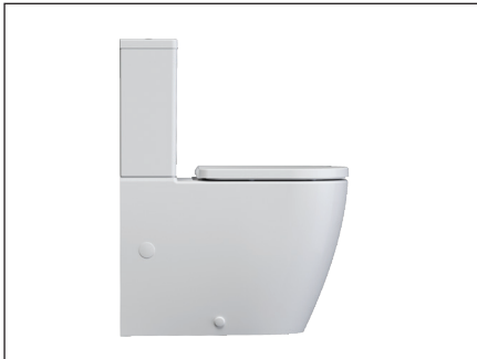
Bottom inlet version of pan pictured

Combining contemporary styling, industry leading rimless pan technology and GermGuard® Antibacterial Protection; a unique technology which kills harmful bacteria, Caroma Cleanflush™ is a superior flushing system suitable for domestic and commercial applications. Incorporating several patented technologies: Caroma Flow Splitter™, Caroma Flow Balancer™ and Caroma Uni-Orbital® Connector, the Cleanflush pan is innovative and the next evolution in toilets. The Flow Splitter evenly flows water around the top of the bowl to meet at the Flow Balancer which directs the water powerfully into the sump, reducing the need for brush cleaning. The rimless pan is easy to clean and unlike traditional pan profiles, provides full visibility of any grime build up. Caroma Cleanflush™ provides a cleaner clean for peace of mind.