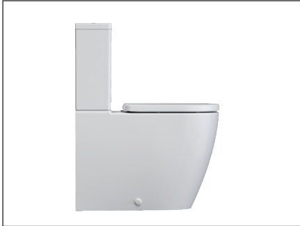
Back entry version of pan pictured