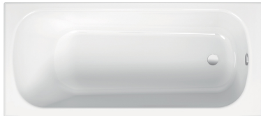
Shown with overflow