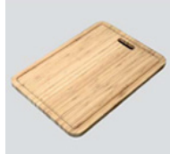
B30.42 chopping board