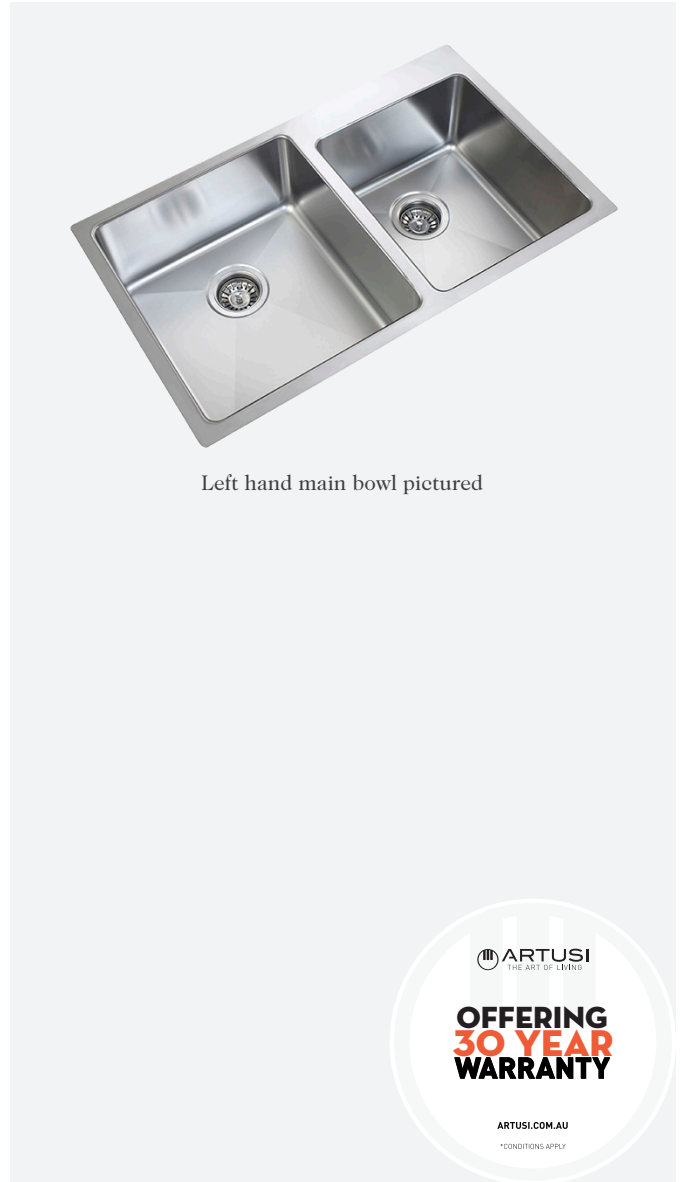
Left hand main bowl pictured