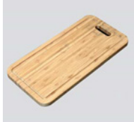
B20.42 chopping board